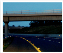
Cat's eyes are light reflectors