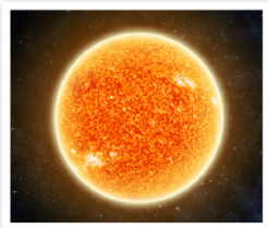
The Sun is a light source

A light source is something that gives out light. Light sources can be natural, such as the Sun, or man-made, such as electric light bulbs. Some objects also appear to give out light but are not light sources. Instead, these are reflectors of light. For example, 'cat's eyes' in the road reflect the light from car headlights. The Moon reflects the light from the Sun. High visibility safety clothing also reflects light, making cyclists and runners more visible at night.